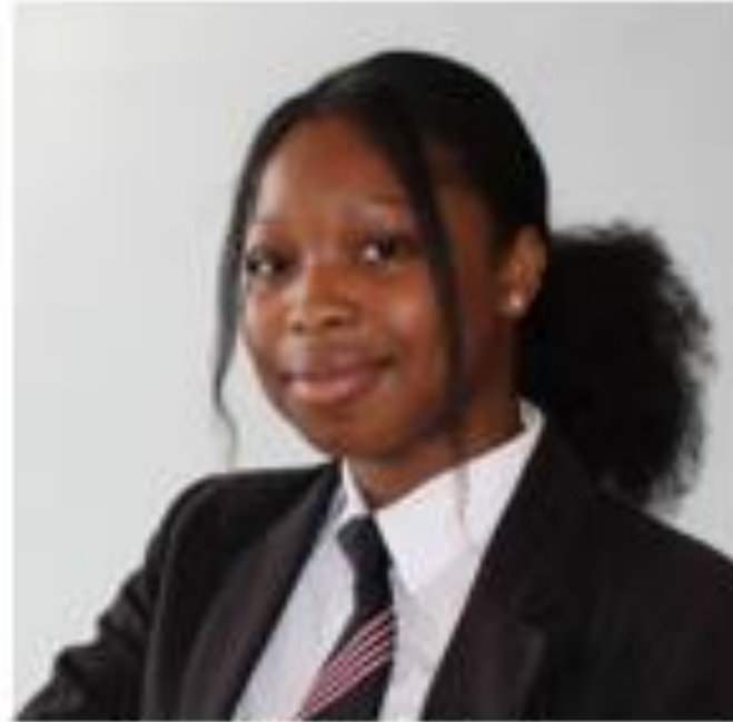
Head Girl - Fanta